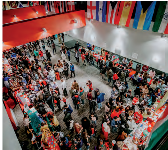
The first annual Global Huskers Festival hosted during International Education Week celebrations in November. The event attracted more than 500 UNL and community visitors.