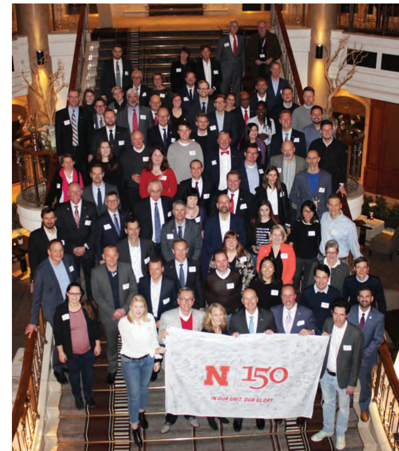
Participants from the Friends and Alumni Reception in Berlin, Germany stand with the N150 flag in honor of UNL's 150th anniversary.