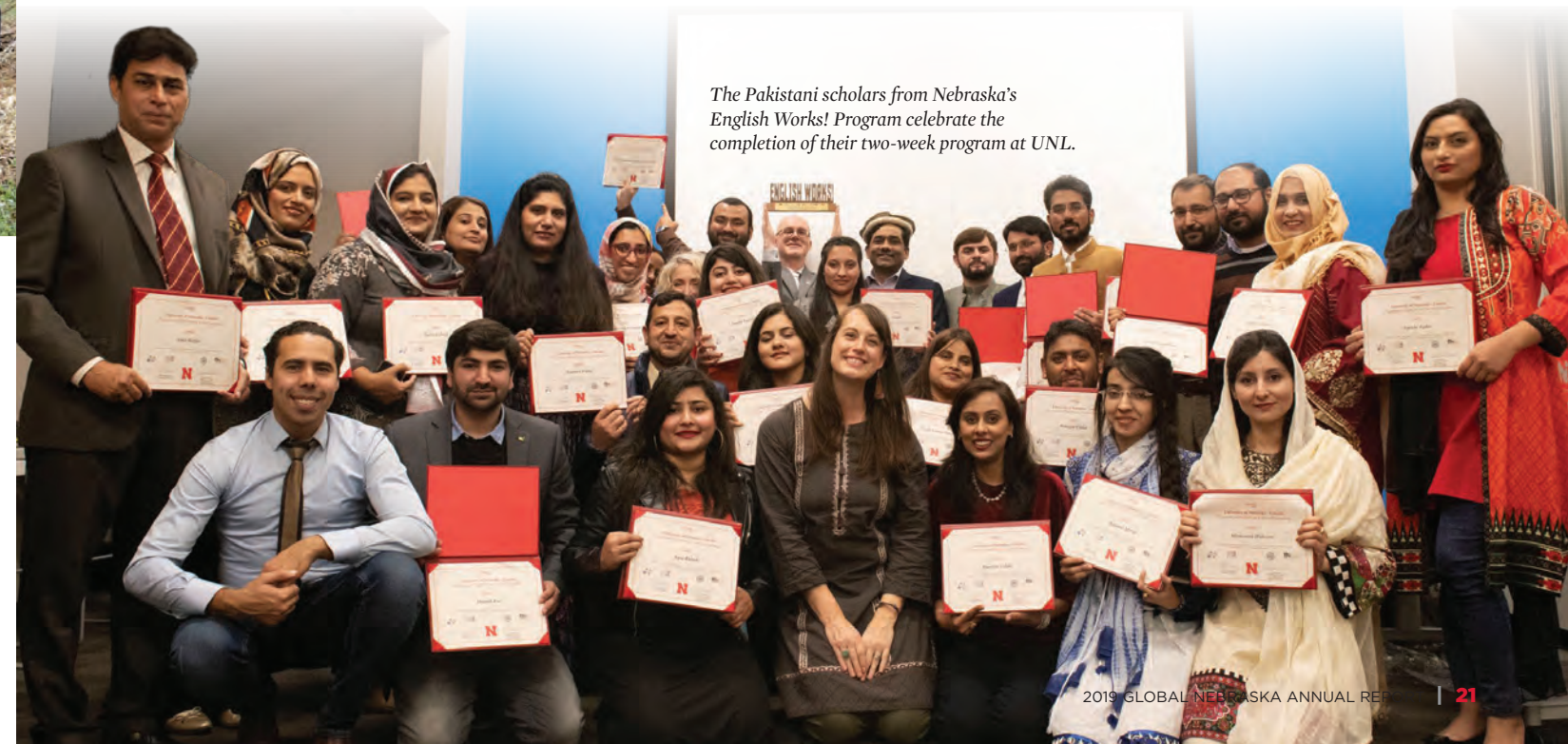
The Pakistani scholars from Nebraska's English Works! Program celebrate the completion of their two-week program at UNL.

To learn more about the customized programs PIESL offers, visit http://www.unl.edu/piesl/customized-programs .